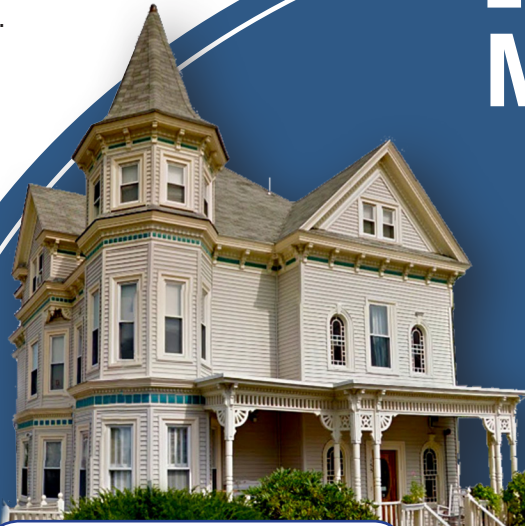
Ishah House Transitional housing program for at-risk and homeless women.