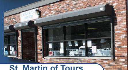
St. Martin of Tours, St. Francis, St. Clare, and Good Shepherd Thrift Stores