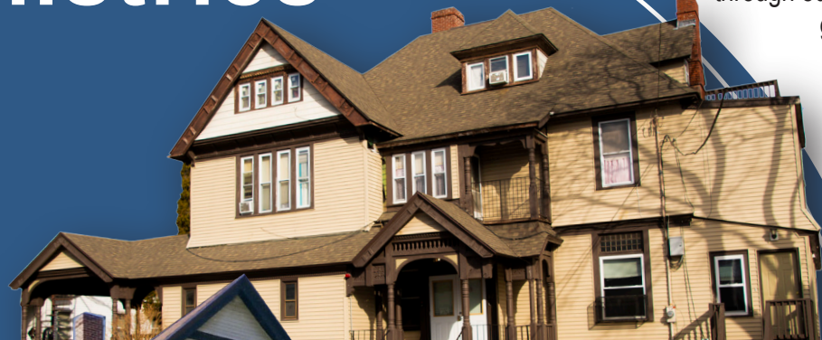
St. Nicholas Residence Our newest residence offering 7 additional units of transitional housing.