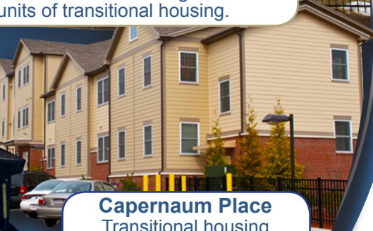
Capernaum Place Transitional housing program for 18 families.