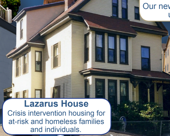
Lazarus House Crisis intervention housing for at-risk and homeless families and individuals.