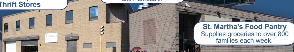
St. Martha's Food Pantry Supplies groceries to over 800 families each week.